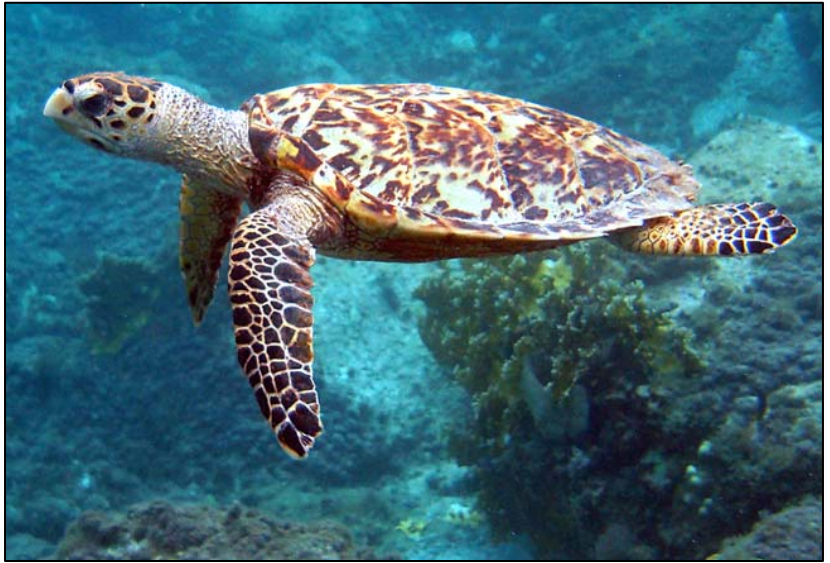
Hawksbill Sea Turtle in Florida.

To date, nearly 200 species of epibionts have been reported from loggerhead turtles – including algae, sea squirts, sea stars, barnacles and crabs. Hawksbills, likewise, host these organisms, but they also host an array of reef animals not seen from loggerhead turtles - like foraminiferans and snapping shrimp. Recently I was sent a collection of barnacles to examine from a dead stranded adult, male hawksbill turtles from Juno Beach, Florida (Palm Beach County). In this collection of barnacles was a species rarely encountered in U.S. waters, Platylepas decorata , originally described in 1854 by Charles Darwin; and there was another species I had never encountered before.