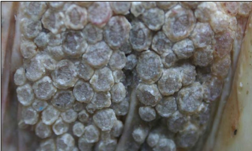
Stomatolepas bernardonii ag

Because only a dozen or so specimens represent the only known examples of this species known to science, and these are from only a single host hawksbill turtle, there is still much to learn about this new species. It is possible that S. bernardonii also occurs on other turtle species and it may be found in regions outside of Florida. Hopefully barnacle collections will continue to come my way and hopefully these will contain more specimens of S. bernardonii . Until then, it appears that this new species is endemic only to hawksbill turtles.